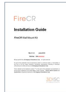
Wall Mount Kit Installation Guide